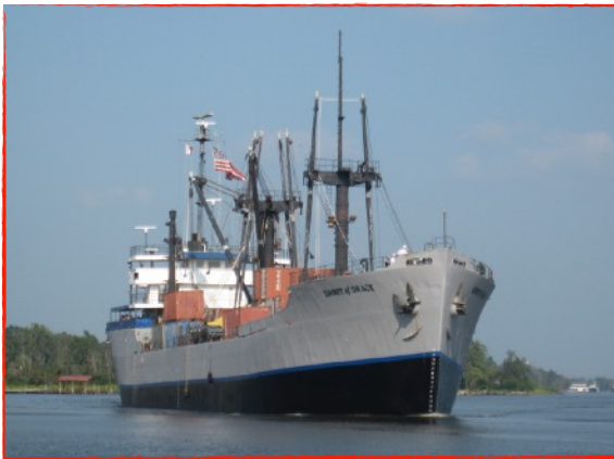
SPIRIT OF GRACE

This month at Port Mercy, we had a wonderful team from MSU. They accomplished much in the greenhouse, the container yard, crew housing and aboard Pelicans Nest. We were also blessed with a large donation of tools and we continued to collect and distribute food every day.