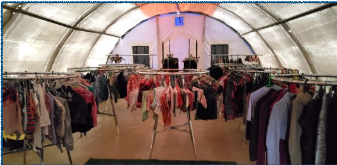
THE DISTRIBUTION TENT