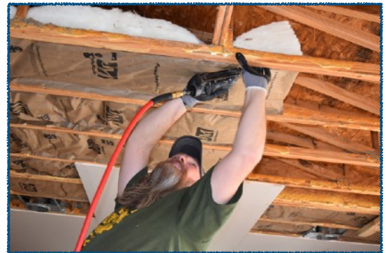
... AND INSIDE

At our home base, Port Mercy in Lake Charles, we were blessed this month with help from Victory Sulphur and the Vineyard Church of Lake Charles.