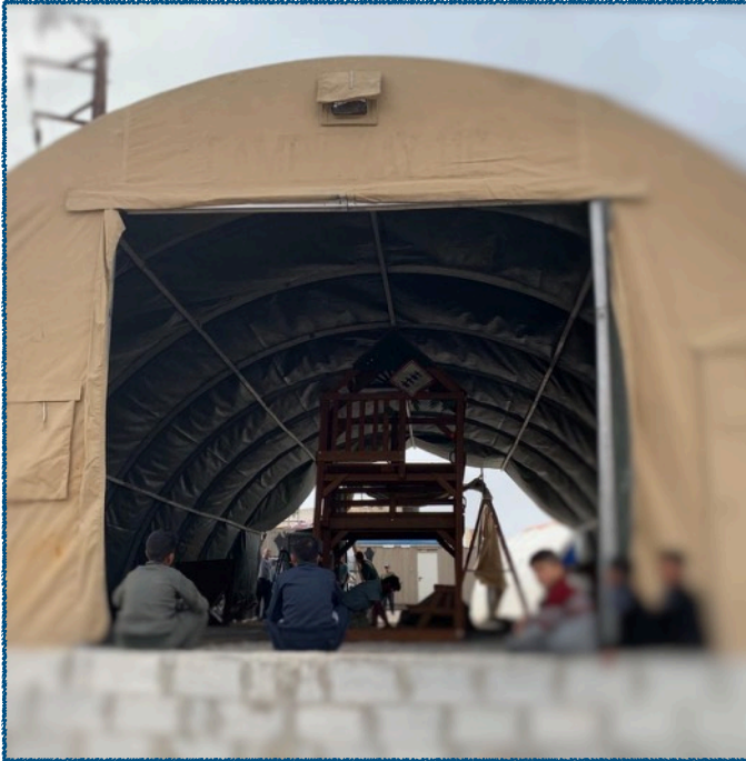
CHILDREN WAIT IMPATIENTLY AS THE PLAYGROUND IS BUILT