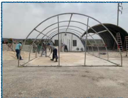
BUILDING THE FACILITY