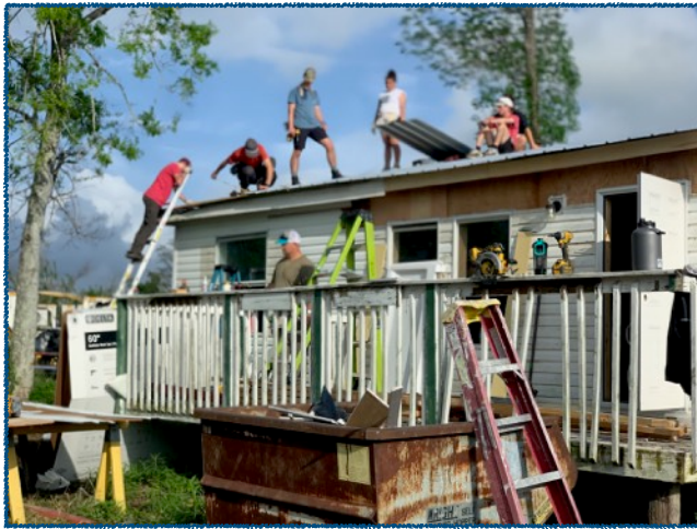
REPAIRING THE HOME OUTSIDE

Victory brought a huge team and worked for three days on a mobile home so that it may be used for housing for our long-term, volunteer crew. They did such an excellent, professional job and took the project a long way toward completion. The Vineyard team worked hard and accomplished much, helping us sort linens donated by a local casino so they are ready to be utilized for disaster relief.