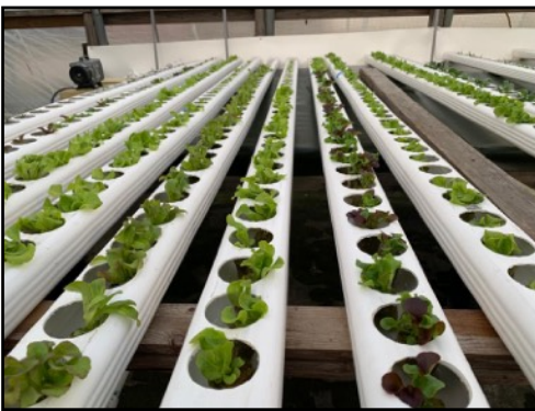
ONLY A FEW WEEKS AGO

Thank you for the wonderful support you continually pour out on Friend Ships. We are so appreciative of your love and thoughtfulness!