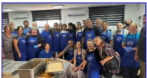
THE TEAM WORKING TOGETHER WITH LOCAL ISRAELI ORGANIZATIONS

SEA HAWKS A wonderful new group of Sea Hawks started the program in August. They will spend the first three months in basic training, acquiring skills to help them in missions work and in life! The students have hit the ground running with orientation, Bible studies, physical training, basic medical skills, food ministry, food service and etiquette class.